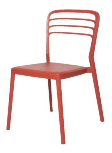
Figure 2: Louvre chair

We have also worked with Sime Darby Plantations to convert their used fertilizer bags into plastic resins. The resins were ultimately turned into plastic chairs. Each consumer product tells a story of recycling and the circular economy, and how collaboration between businesses and consumers can make a difference, instead of completely rejecting plastic.