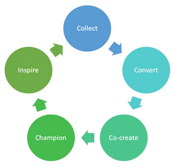
Figure 1: Heng Hiap Industries 4C Pro-

The 4C programme is the HHI Plashaus version of the fabled circular economy: it is simple, collaborative and it works (Figure 1). In addition, HHI has joined with KIAN Furniture (Malaysian company based in China) to create the Louvre chair us-