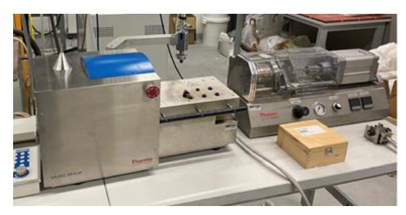
Image 2: Device for the production of sample specimens: mini extruder & injection molding machine for production of test specimen for toys and baits (Source: ACIB).

using processing roller mixers, mini extruders and mini injection molding machines to produce these blends and samples thereof. Various ratios of the components have been investigated so far and the second round of analyses and experiments will focus on the properties and processability of these compounds.