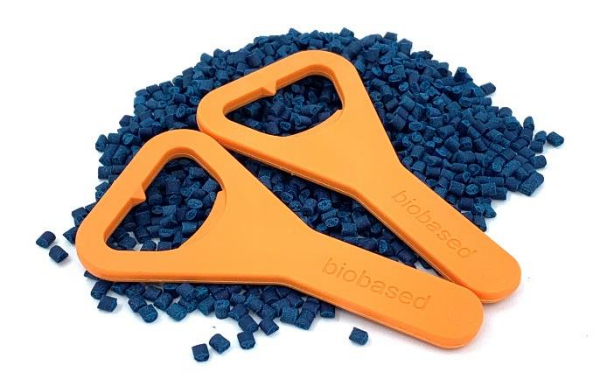
Image 6: Arctic Biomaterials focuses on strong biode gradable materials reinforced with degradable glass fibers.

The latest development steps of the materials are about to be finalized, after which the samples will be produced and distributed to the project partners to start testing round II. At the same time, companies manufacturing injection molded cutlery will be invited to test these novel materials as a proof-of-concept.