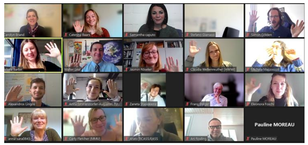
Image 1: The 3rd Executive Board Meeting kicked off in high spirits.

Day 2 revolved around how project results are used to inform policy and decision makers. Existing safety policies as well as results of safety analyses carried out during the project are being used to develop a safety protocol for bio-based plastics. As part of this safety protocol, a sustainability framework outlines how sustainability can be implemented for biodegradable bio-based plastic products. BIO-PLASTICS EUROPE is also working on a policy framework, that uses inputs from the project to produce recommendations for EU policy development. Furthermore, a newly published handbook on the impacts of biodegradable bio-based plastics on